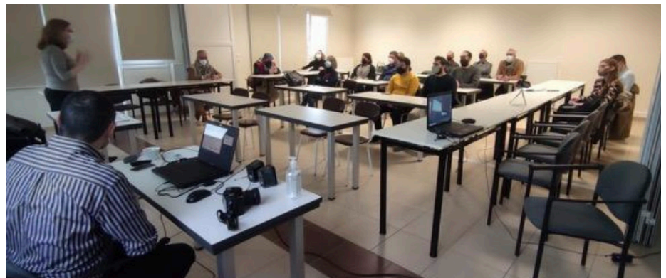
Greece multiplier event 05/03/2022

Latsia, and we invited youth workers, organisations, politicians, stakeholders and other participants to join this event to introduce them to the project and well as the main concepts of restorative justice, media education and gender-based violence. The event within the context of the International Women's Day allowed us to engage with the participants and parallel their own work with the outcomes of the C4C project. This was also the first event post-covid that we could interact with each other without the covid-related restrictions such as wearing masks in closed areas (as everyone were vaccinated (and signed declaration of covid-risk management)).