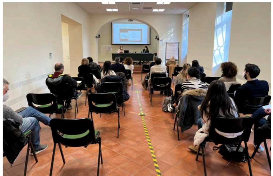
ASAD mulplier event 14/02/2022

The main theme of the conference was “The skills of educators and youth workers for the prevention of gender-based violence”, and then the three main interconnected themes were deepened and developed: “Gender-based violence in the media” where it was possible to share how to work with young people to use technologies in a way that allows them to broaden their understanding of social problems, such as “technology addiction”. This aspect will also enable a C4C facilitator